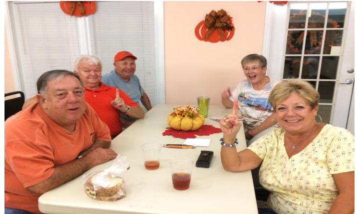
Table 2 (Oct. 6 Winners)