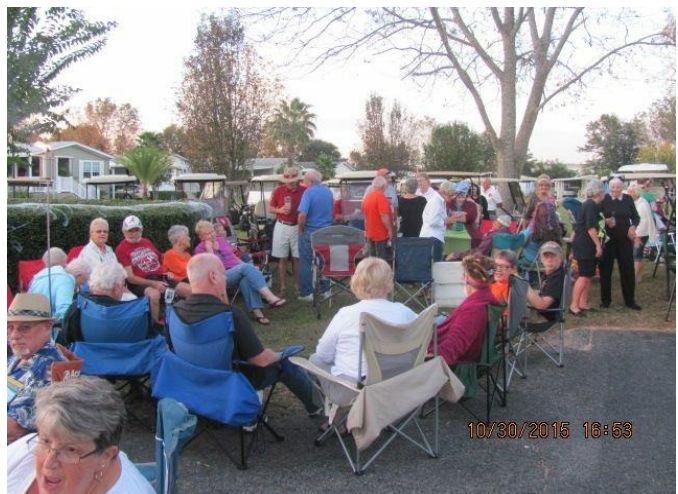
a group sitting & mingling around