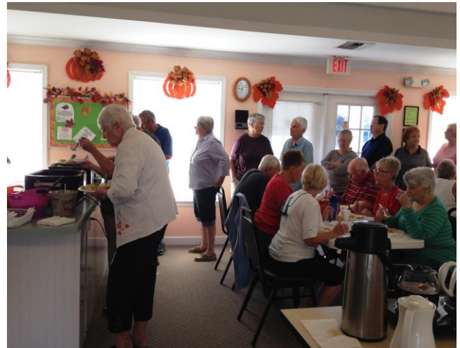
Enjoying the good Breakfast food