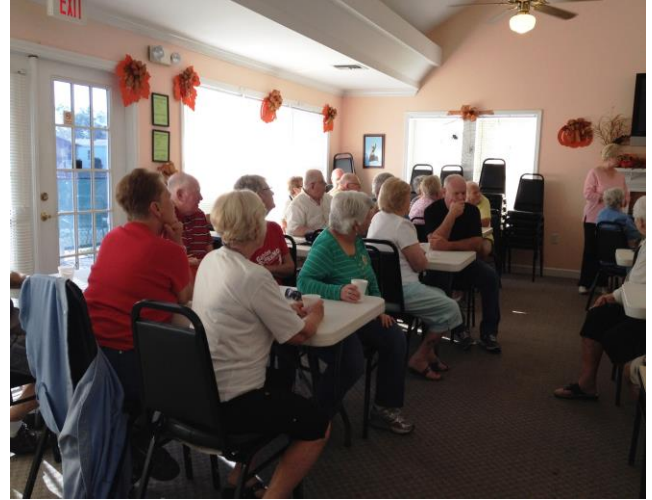
New residents introducing themselves