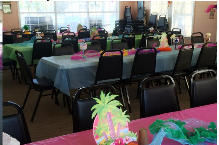
Clubhouse decorated for Luau