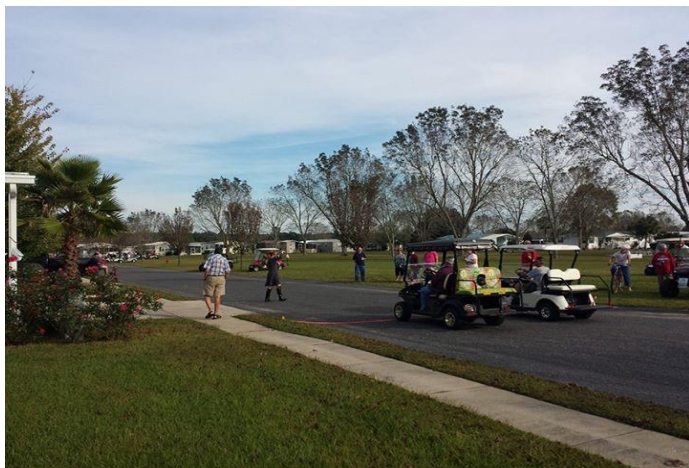
Another pair getting ready