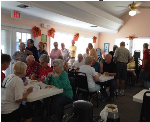
Enjoying the breakfast