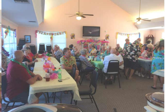
Getting ready for the fish and all the other good food