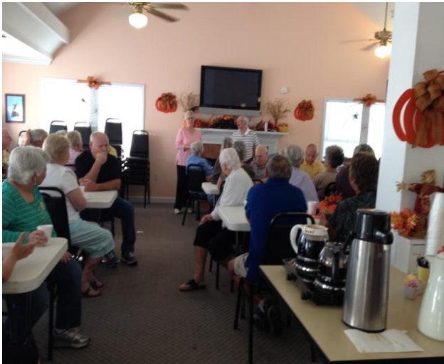
New residents introducing themselves