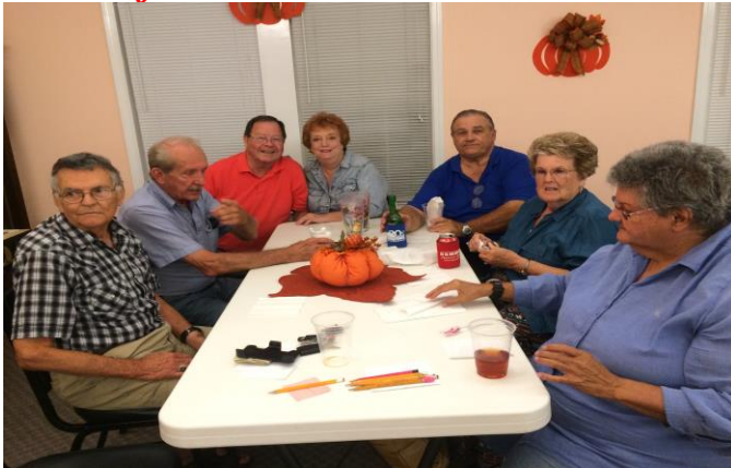
Table 1 (Oct 6 Winners)

On Oct. 20 several people came to enjoy the hot dogs & bratwurst with chili, cheese, & corn chips, which was free. This was to thank everyone who has been donating their money for the trivia food for all this year. We had table 3 who was the big winner for this date and tables 1, 2, & 5 tying for 2 nd place and table 4 for 3 rd .