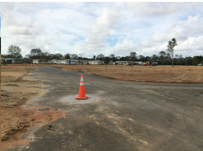
PONDVIEW DR. (WEST)