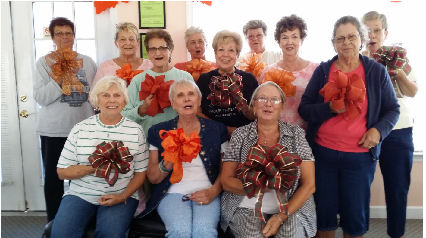
Some beautiful bows were made