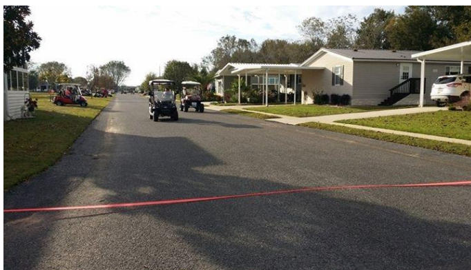
A pair racing