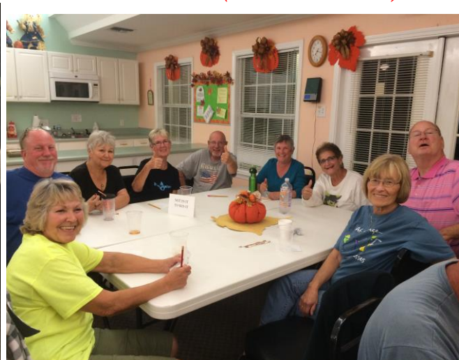
Table 3 (Oct. 20 winners)