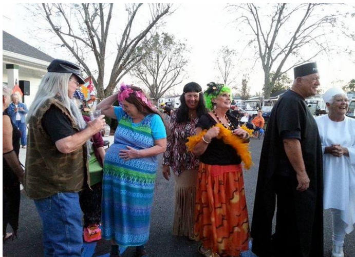
Some of the contestants for best costume