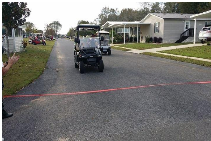
And the winner across the line