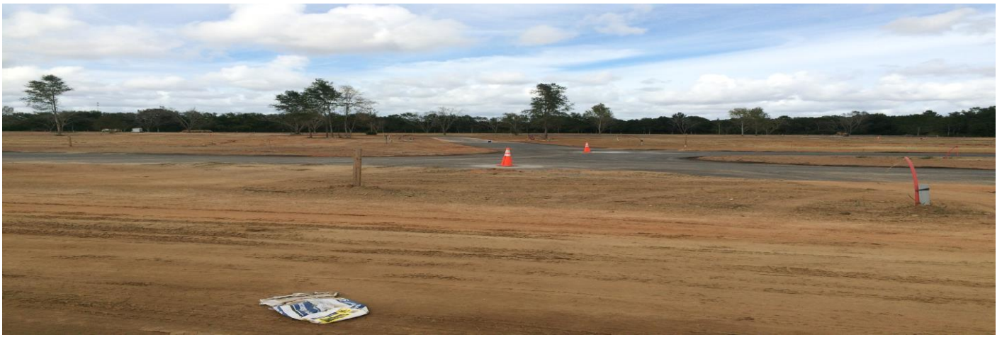
TANGELO DR (NORTH)