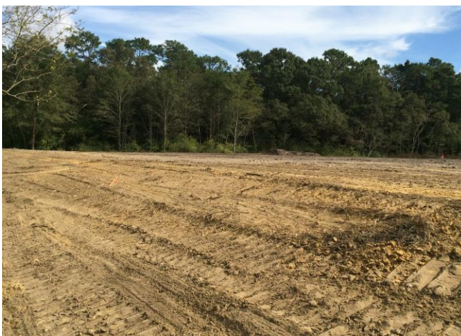
SOUTHEAST VIEW OF RV & BOAT STORAGE