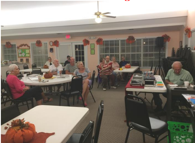
Singing along & enjoying the music