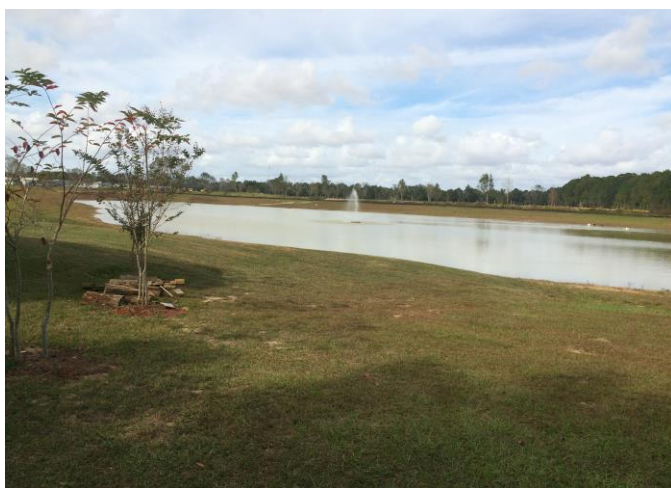
LAKEVIEW OF PHASE II