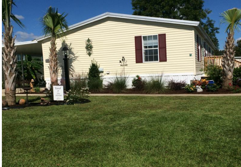
Chuck & Bev Morgan 18099 Sapphire Ln Lot 138