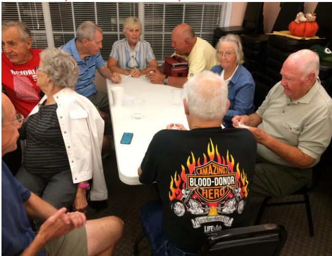
Table 5 (Oct. 6 Winners)