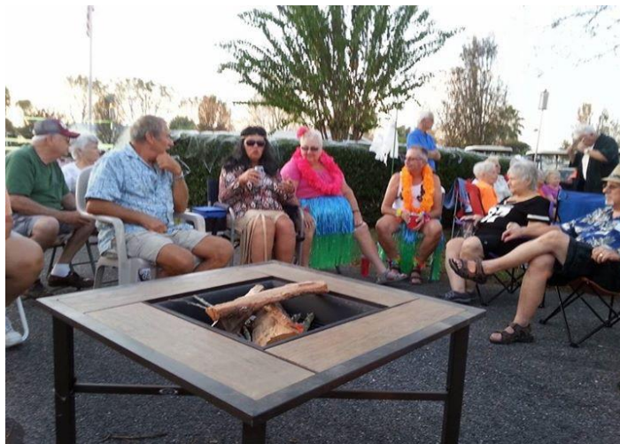
some more sitting around the fire