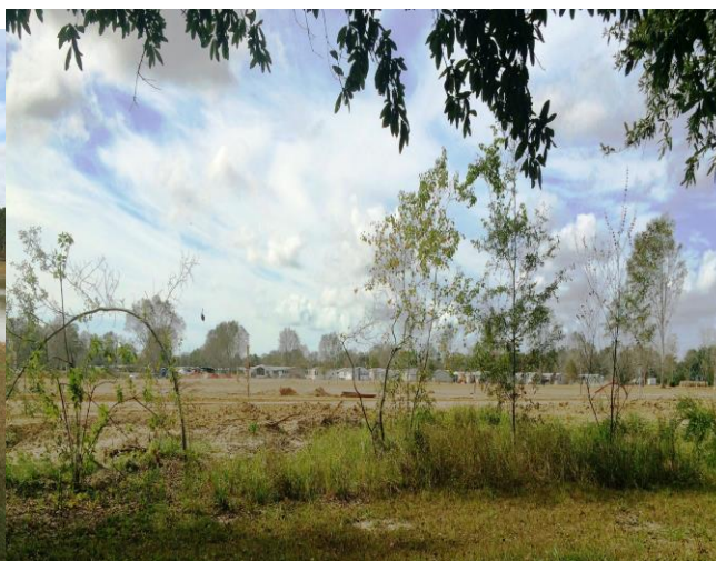
WESTVIEW FROM BACK PATH