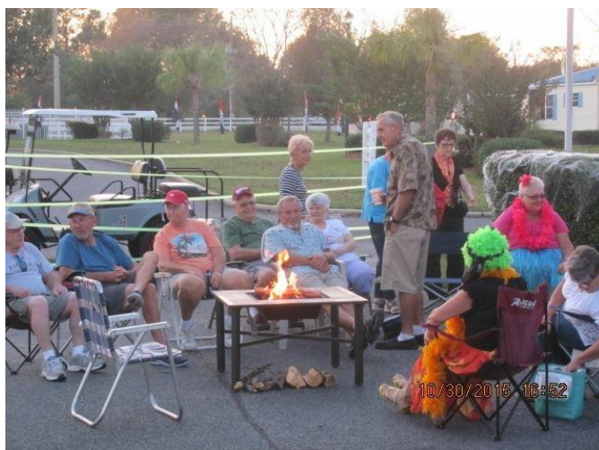
Talking, mingling & sitting around the fire