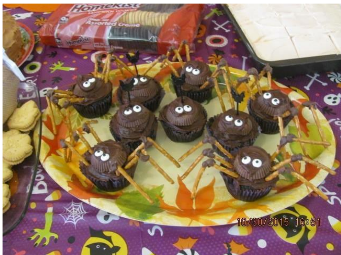
Spider cupcakes winner