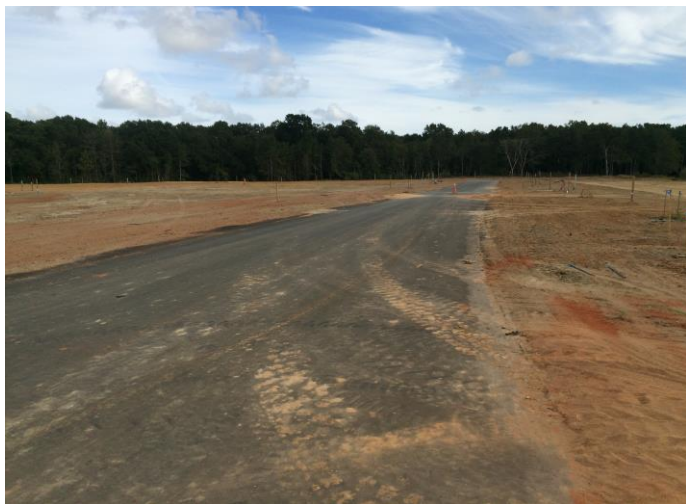
PONDVIEW DR. (EAST)