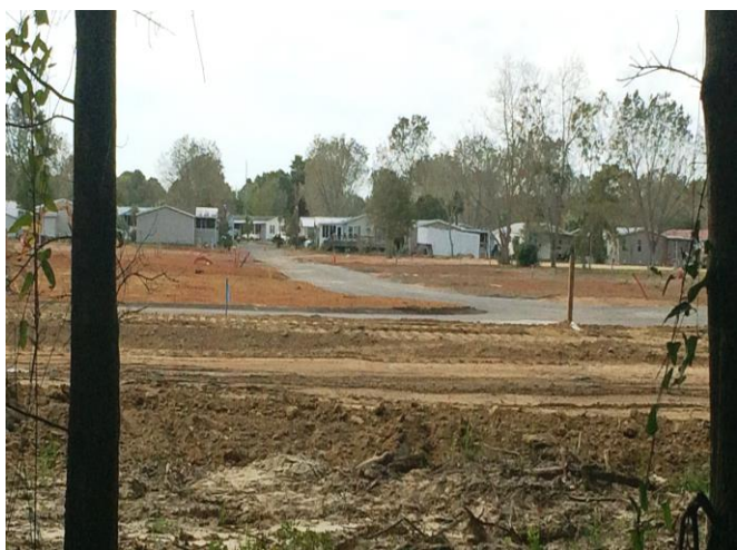
WESTVIEW OF CASTLE DR FROM BACK PATH