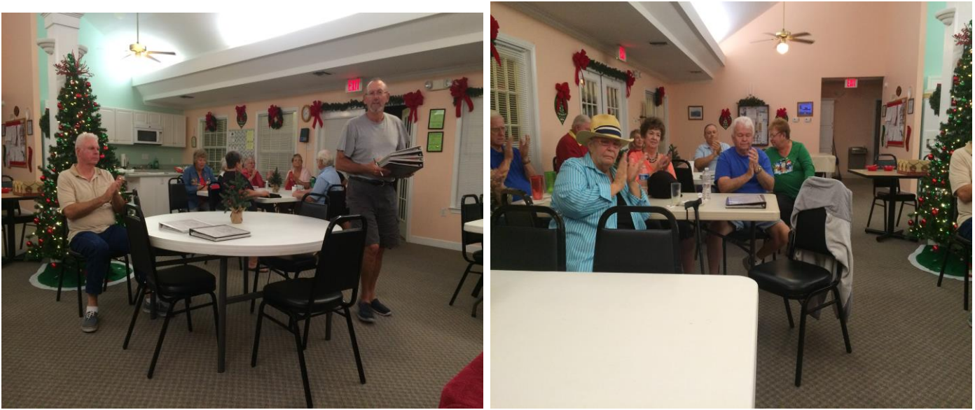
Clapping and singing some Christmas songs