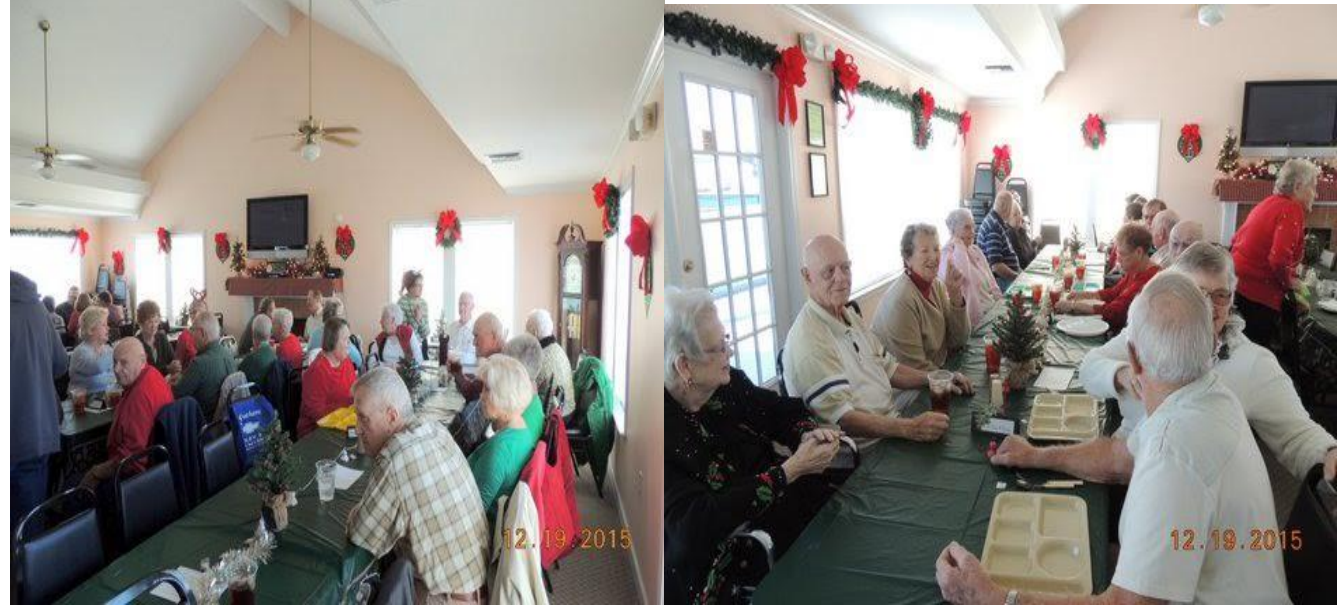
Socializing and waiting for dinner to start