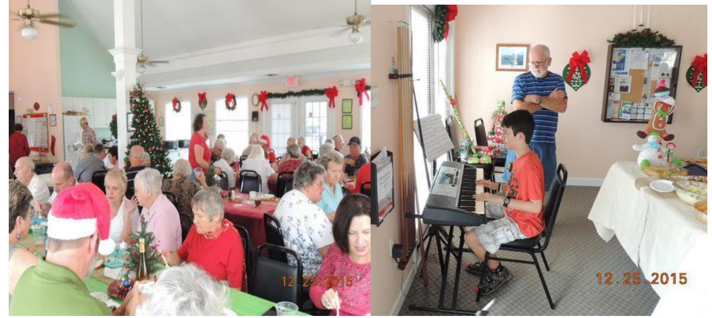
More enjoying the food