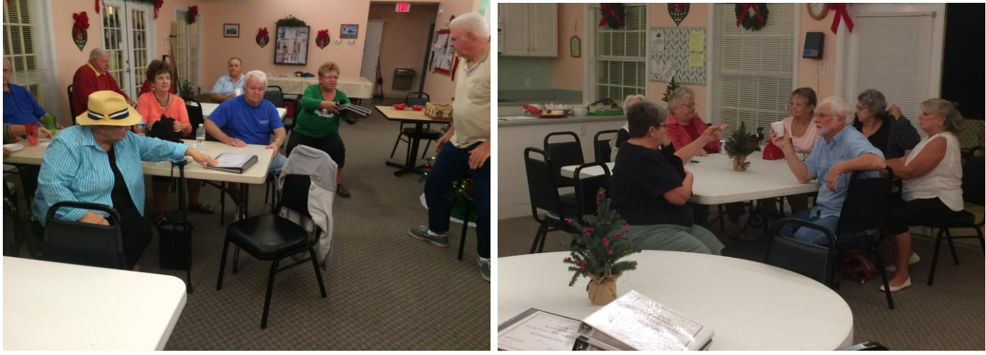
Socializing and getting ready for the next song