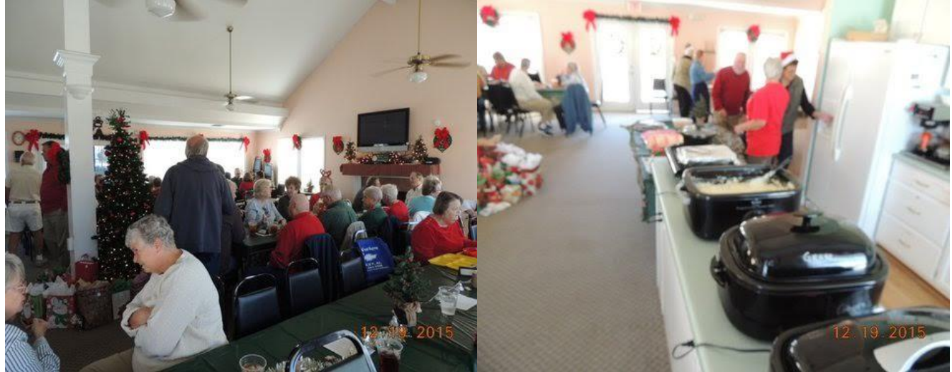
Socializing and getting the food ready to serve